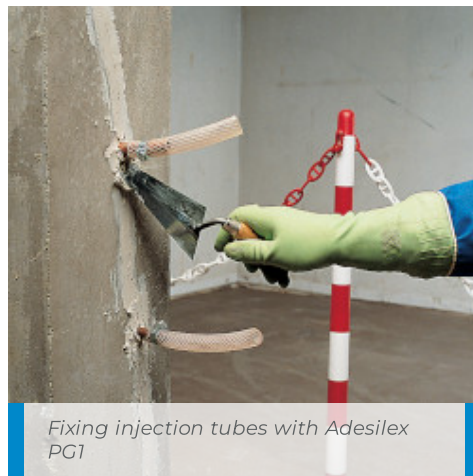
Fixing injection tubes with Adesilex PG1