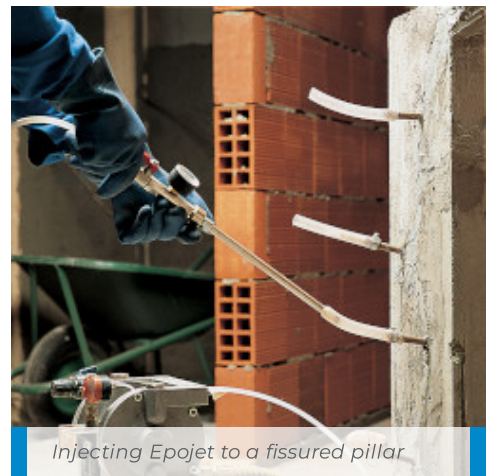
Injecting Epojet to a fissured pillar