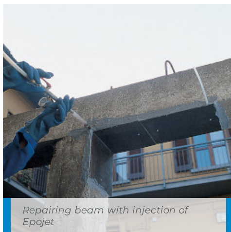
Repairing beam with injection of Epojet